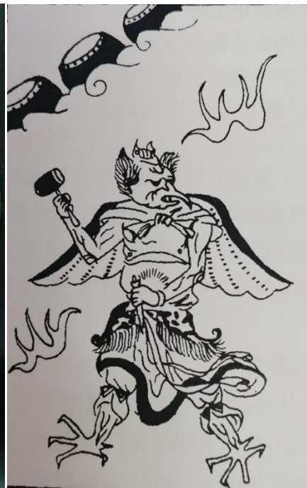
Tuo (the animal)

The relation between thunder and drums can also be explained by the timing of making drums. According to Zhouli Officer of Winter , “every drum must be made only on the Insects Awaken Day”. That was because on that day thunder would awaken all the insects thereby people made drums to “contain the power of thunder into the drum” which means that the emperor was enlightened by the power and law of the heaven.