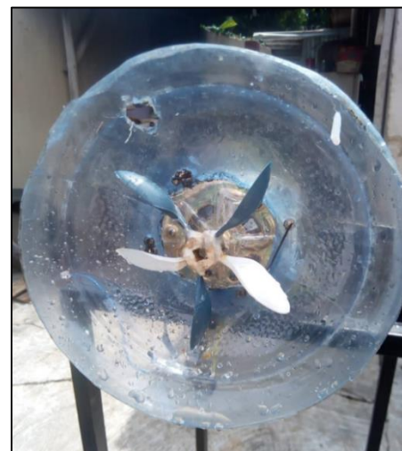
Fig 3: Designed blade for the mini Hydro-Electric power plant

2.2. Methodology: According to Torricelli's Theorem velocity of efflux i.e. the velocity with which the water flows out of the tap was calculated using the formula