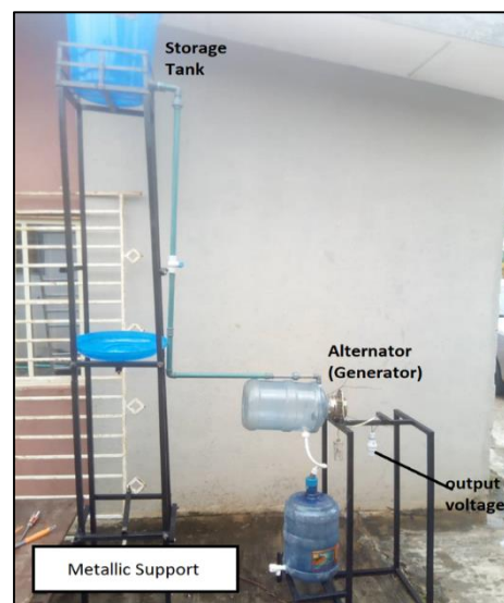
Fig 2: Complete arrangement of the mini hydroelectric power plant