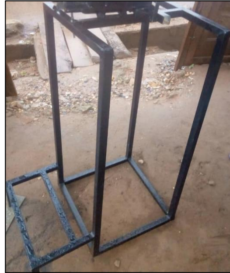
Fig 1: Constructed metallic support for the alternator

The materials used to accomplish the research includes a plastic bucket, pipes, elbow joints, alternator, constructed metallic stand, lamp holder, electric wires, plastic blades. In order to ensure that the storage tank is placed at a maximum height to the tap for rotating the turbine blade, a metallic support was constructed as shown in Figure 1 and 2, Figure 2 shows the complete set-up/arrangement of the respective components of used in the design of the research, Figure 3 depicts the designed blade which enabled easy rotation based on the low weight plastic materials used in its design.