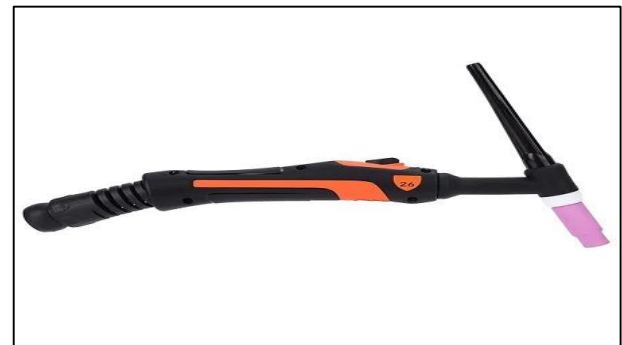
Fig 2: Welding Torch