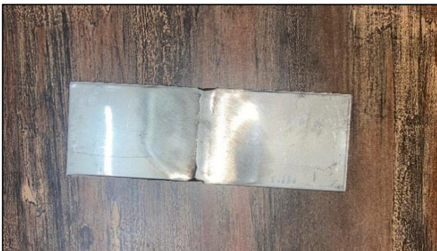
Fig 4: Welded job

Visual observations are used to verify penetration following the welding of the work components. Rejected specimens have inappropriate penetration. The impact of welding parameters on bead geometry is investigated by utilizing a traveling microscope to measure the front and rear widths.