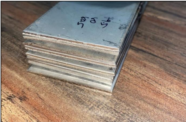
Fig 3: Thicknesses of work piece material of SS310

SS310 is chosen for the study because the process industry uses it extensively. The chosen material thickness was 2 mm. The chosen specimen size, in accordance with ASTM standards, is 60 x 40 mm.