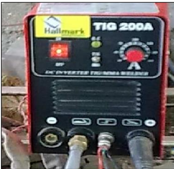
Fig. 1: TIG Welding Machine set-up