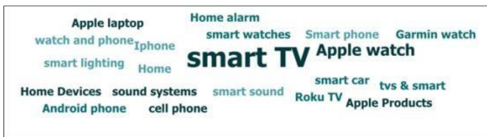
Fig 1: Types of IoT devices listed by 90 respondents mixed between US citizens and non- citizens

(35) US citizens and fifty-five (55) non-US citizens living in the US, majority of the IoT devices exposed to are personal and household items such as smart tv, smartphone, sound systems etc. 50% of the respondents said their most frequently used IoT device is a smart tv, 29% said they owned an apple watch specifically, 15% said a smart car, 11% went for sound systems.