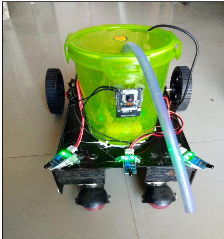
Fig 2: Snapshot of Module