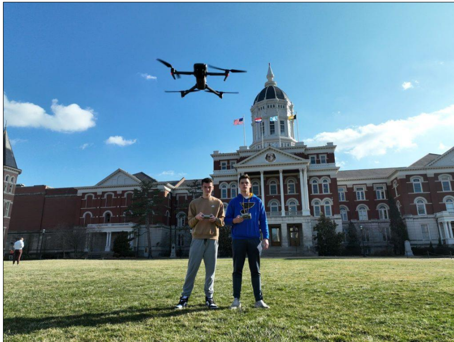
Fig 2: A drone is usually controlled by operators on the ground [4].

Once the drone is flying it can move forward backward left and right by spinning each propeller at a different speed. Then the pilot uses the remote control to direct the flight from ground [8].