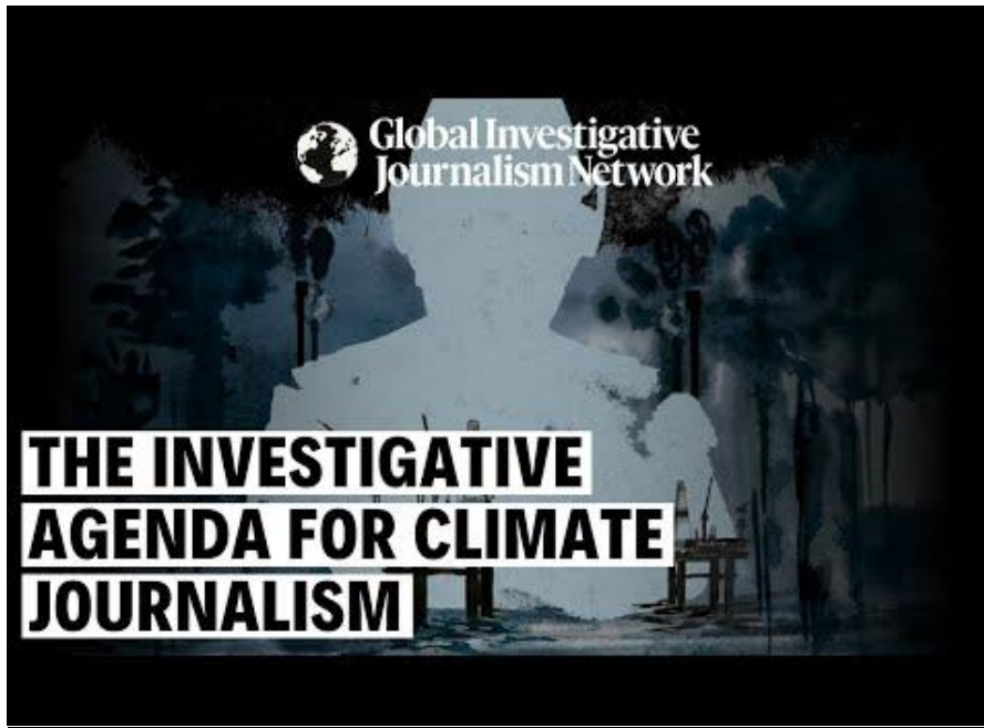
Fig 5: Investigation of Latin America's global reach for illicit activities [10] .

Union Aviation Safety Agency (EASA) in Europe. These rules often restrict where and how drones can be flown: including limitations on flights over crowds: near airports: or at night without special authorization. In some regions: especially where drone laws are expensive: restrictive: or unclear: regulation can also limit press freedom. For example: in Zimbabwe: a freelance journalist was reportedly arrested for operating a drone while covering abandoned government road projects.