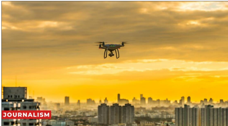
Fig 3: A typical use of a drone in journalism [8].

For decades, the physical and financial limitations of aerial reporting constrained the scope of visual journalism. The advent of drone journalism has disrupted this paradigm. What began as an experimental novelty in the early 2010s has rapidly evolved into a crucial tool for modern newsrooms. By offering unprecedented aerial perspectives, cost-effective operations compared to traditional helicopters, and access to hazardous environments, drones have transformed visual storytelling. Figure 3 shows a typical use of a drone in journalism [14].