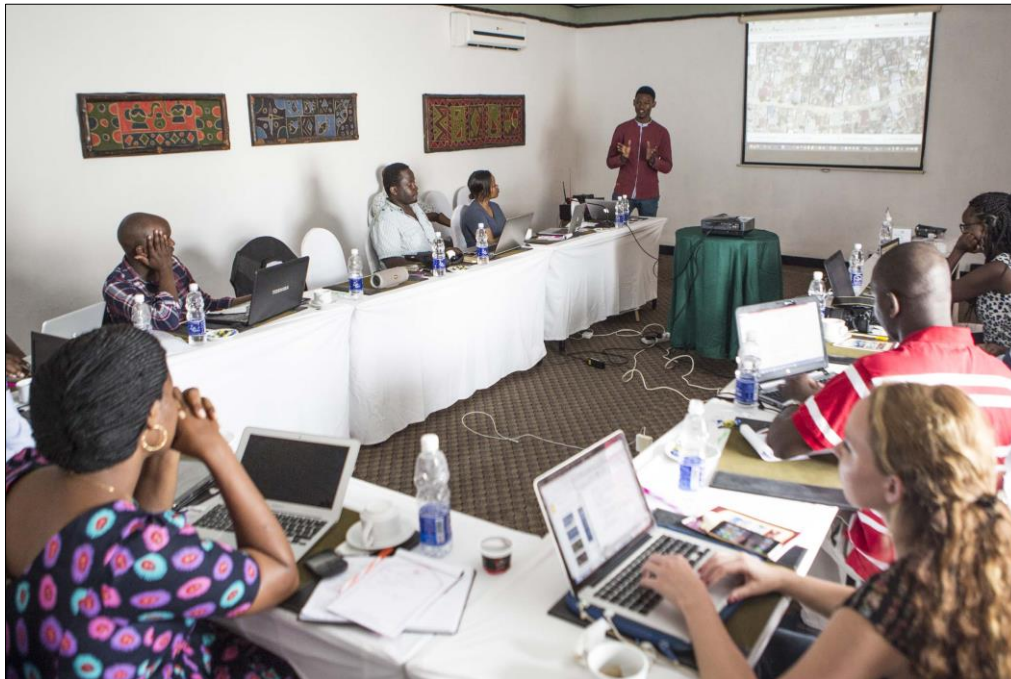
Fig 4: A team of journalists [9]