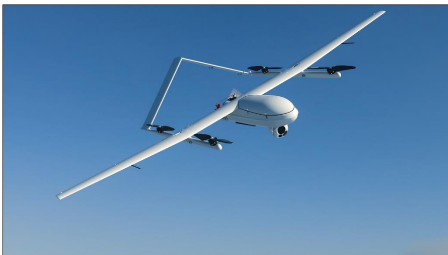
Fig 1: A typical drone [3].

devices, including unmanned aerial vehicles (UAVs), that can fly independently along set routes using an onboard computer or follow commands transmitted remotely by a pilot on the ground. A typical drone is shown in Figure 1 [6]. A drone is usually controlled remotely by a human pilot on the ground, as typically shown in Figure 2 [4]. Drones can range in size from large military drones to smaller drones. Drones, previously used for military purposes, have increasingly been used for civilian purposes since the 2000s. Since then, drones have continued to be used in intelligence, aerial surveillance, search and rescue, reconnaissance, and offensive missions as part of the military Internet of Things (IoT). Today, drones are used for a variety of purposes, including aerial photography, surveillance, agriculture, entertainment, healthcare, transportation, and law enforcement.