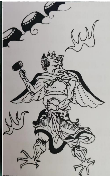
Tuo (the animal)

The relation between thunder and drums can also be explained by the timing of making drums. According to Zhouli Officer of Winter , “every drum must be made only on the Insects Awaken Day”. That was because on that day thunder would awaken all the insects thereby people made drums to “contain the power of thunder into the drum” which means that the emperor was enlightened by the power and law of the heaven.