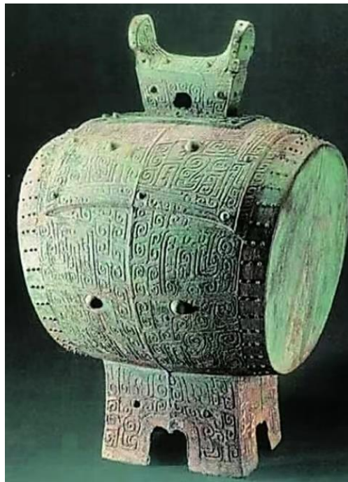
Tuo drum (museum picture)