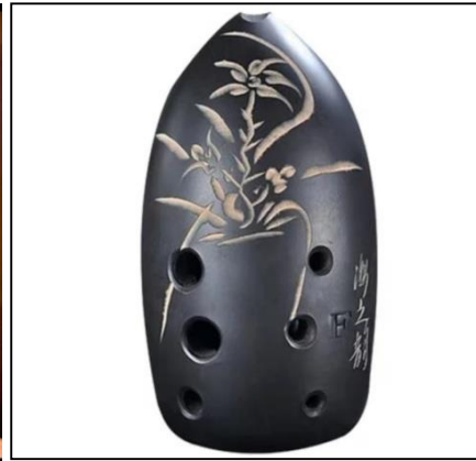
Xun (a modern imitation)

As a powerful natural phenomenon, thunder brings storms and was powerful enough to kill people and animals. Primitive people themselves felt sheer terror about the thunder, besides they saw others and animals disperse in panic. This experiences led them to develop superstitious and reverential beliefs about thunder and lightning, perceiving a mysterious sympathetic connection between the sound of thunder and humans or animals. As a result, they believed that thunder could cause harm to humans and animals even from a considerable distance away and wondered how to produce thunder to use for hunting and wars to frighten their prey and enemies. 2 Thereafter, in the age of primitive society with sorcery prevailing, a sorcery simulating thunder sound was “created”. At first the sorcery might be someone imitating thunder sound and then came the drum. Thus, drum originally was not invented as a musical instrument. The legend of Yellow Emperor creating drum to defeat ChiYou (one of the tribe leaders in ancient China) as follows squarely proves that the first drum was used for war and explains why drums are the common implements of wizards.