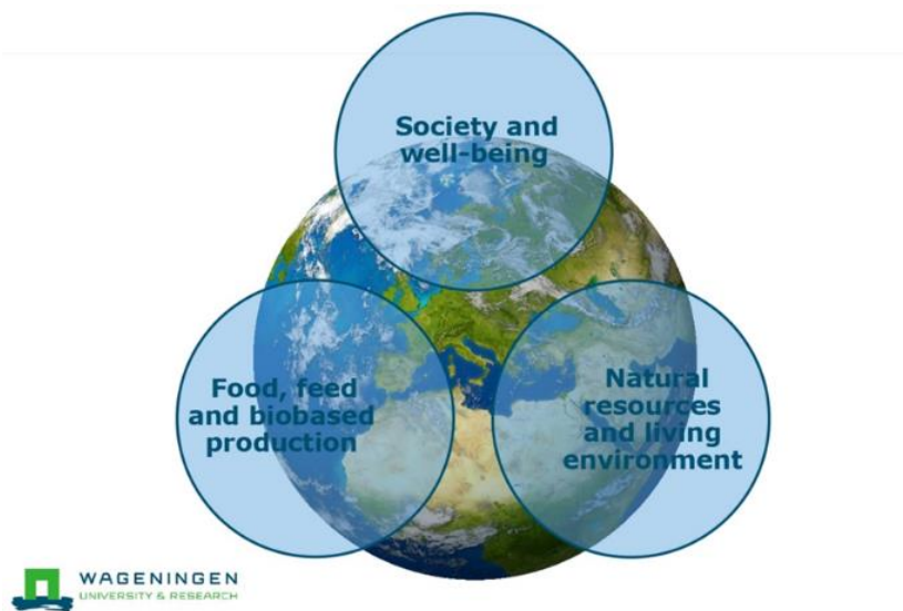
Fig 2: WUR’s knowledge domains of changing world (Arthur Mol, 2016)

WUR’s awareness of important issues in a developing world comprises: society and well-being, food, feed and biobased production, natural resources and living environment (Figure 2).