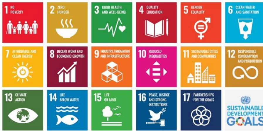
Fig 1: Global Challenges and Sustainable Development Goals