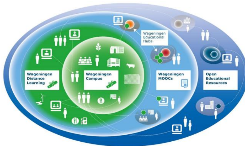
Fig 4: WUR's educational ecosystem (Arthur Mol, 2016)

educational resources, all link and support each other in a unified whole.