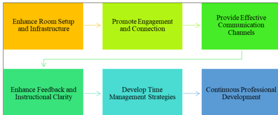
Fig 2: Improvement Plan