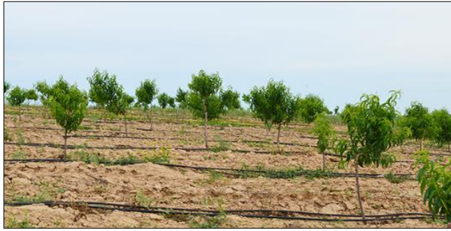
Fig 3: Demonstration of the micro-irrigation regime using drip irrigation of fruit trees in the conditions of the EIA of the Research Institute of Erosion and Irrigation in the Shamakhi district in the village of Malkham.

The discharge was 20-30%, which led to uneven moistening. At the beginning of vegetation due to timely treatments, the surface discharge decreased (up to 8-10%). When the treatment of crops ceased, the discharge again reached 16-17%.