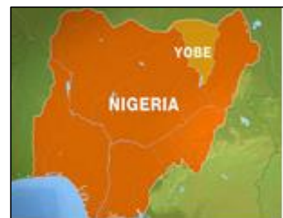
Fig 1: A Map of Yobe State Showing the Study Area.